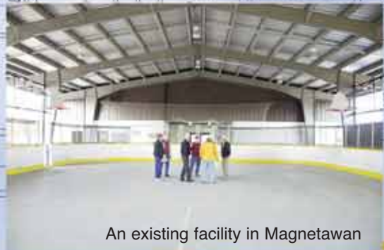
An existing facility in Magnetawan