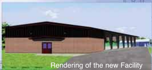
Rendering of the new Facility

In addition to the ice pad the new complex will house a much needed "indoor gymnasium", which will be available to groups and individuals to hold physical activities for residents of all ages, year round.